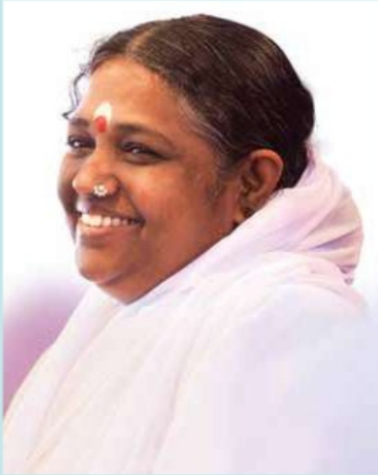
Sri Mata Amritanandamayi Devi

There are two types of Education Education for Living. Education for Life.